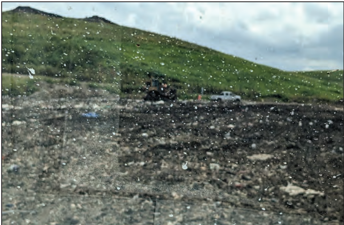
Transition from access road into working facer