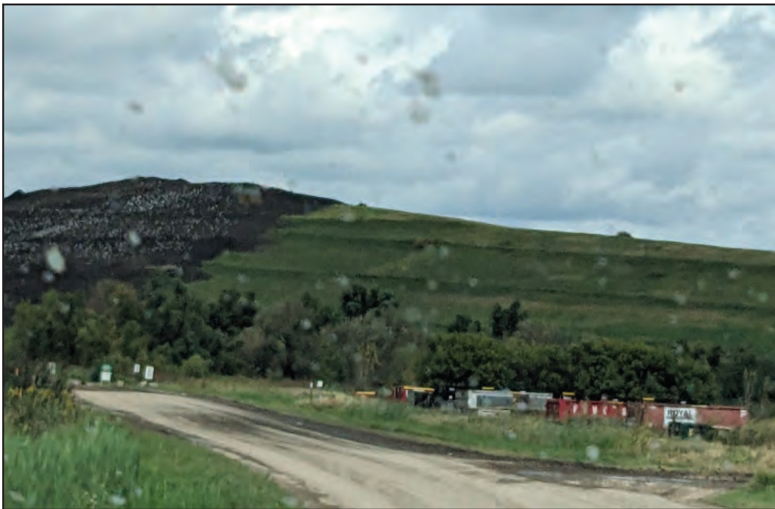
New cap project against previous cap project on West slope of Phases 2 & 3