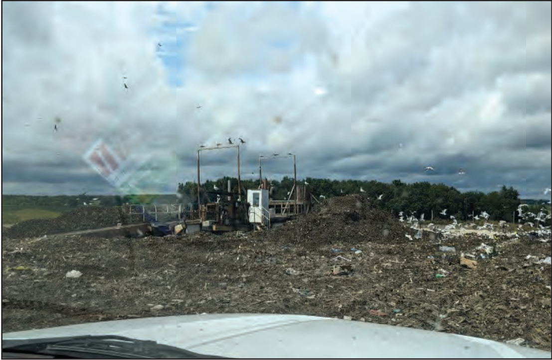
Tipper on West edge of active area while Northern end of Phase 4 is filled