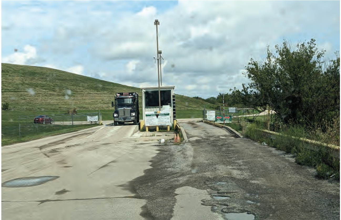
Scale access condition