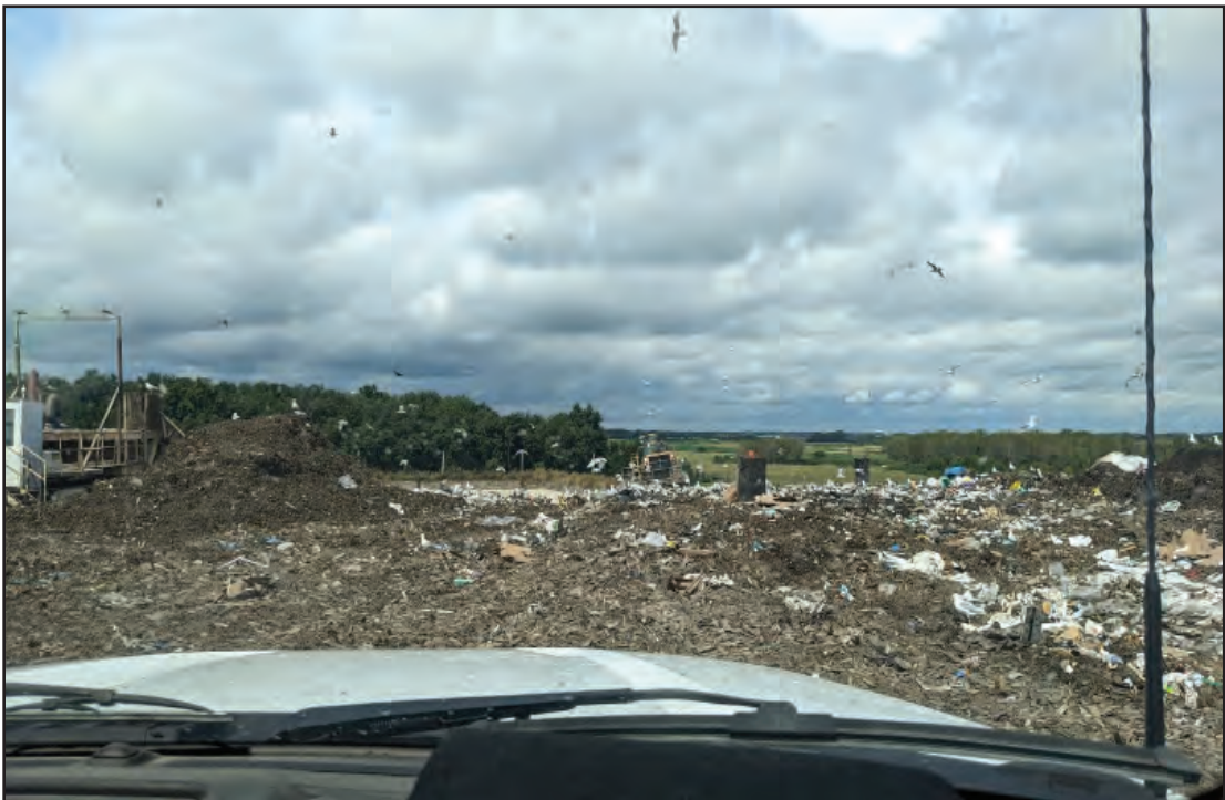
Tipper on West edge of active area while Northern end of Phase 4 is filled