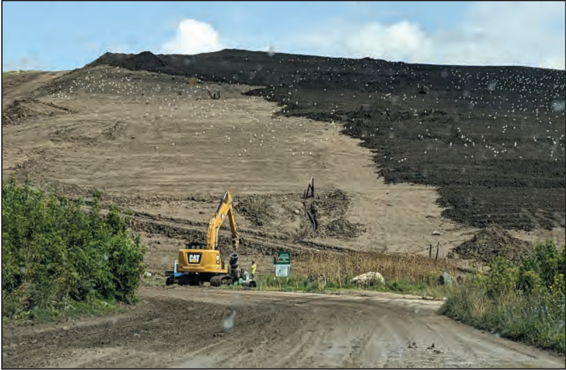
Top soil being spread over capping project