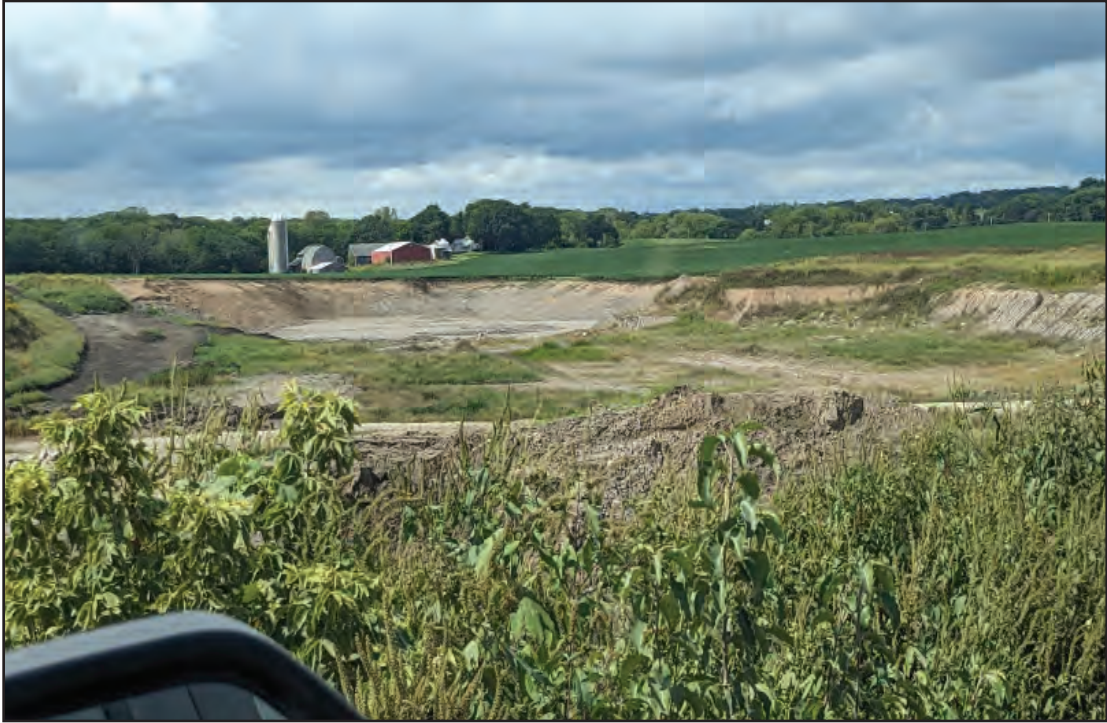
Top soil stockpile and borrow area to9 the West