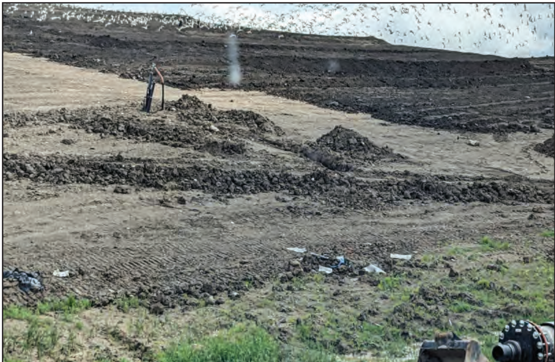
Top soil being spread over capping project