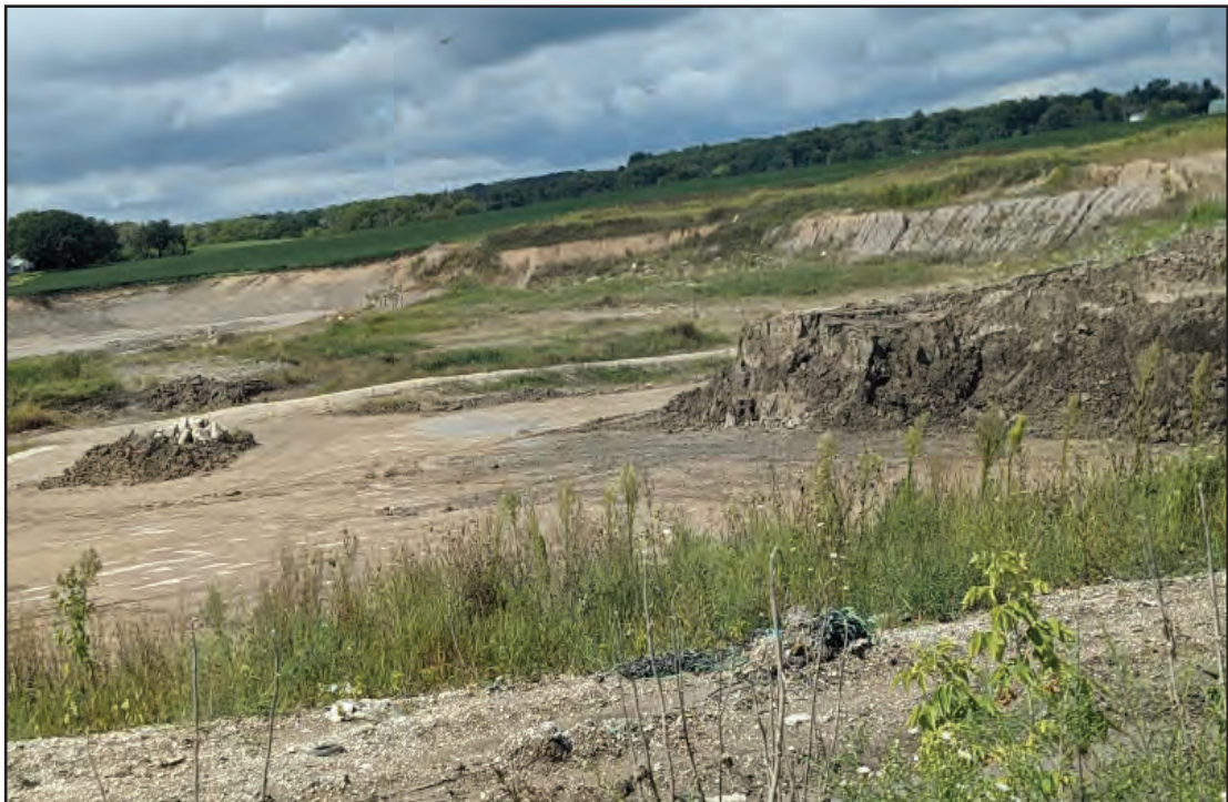
Borrow area and future cells to the West