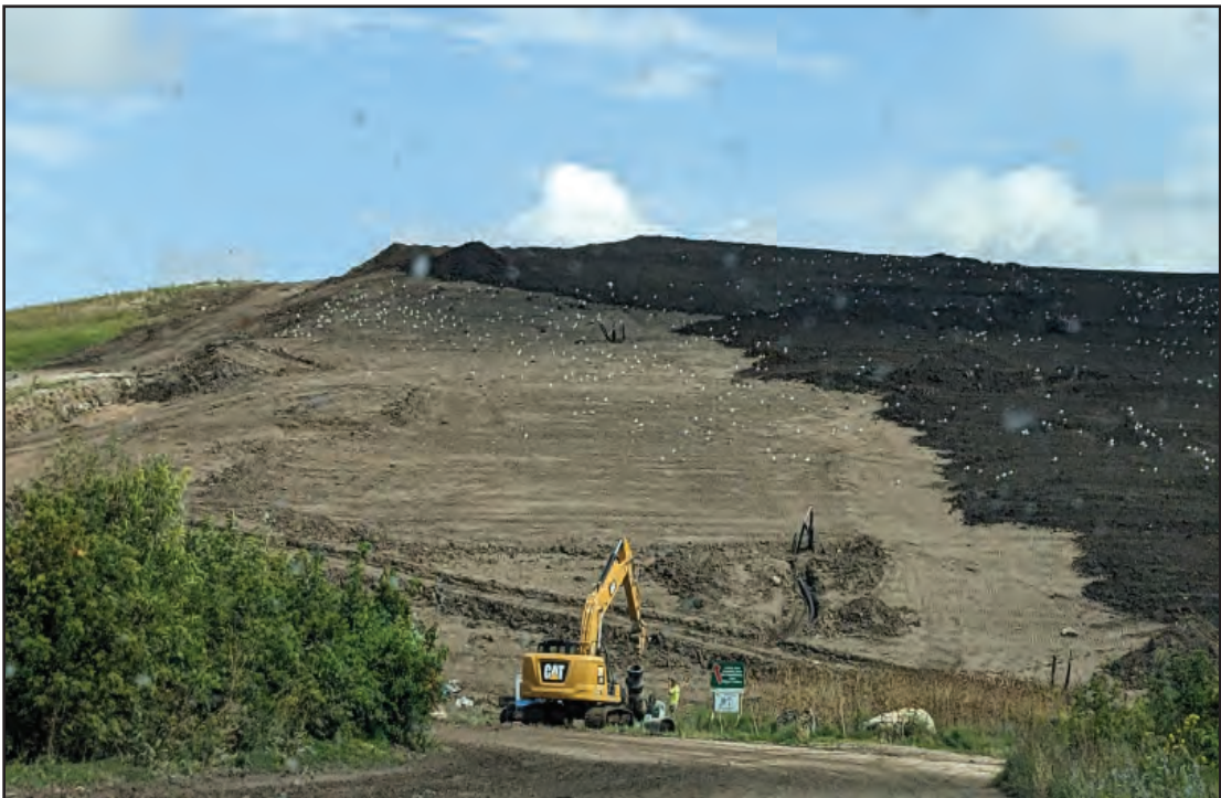
Top soil beimg spread over capping project