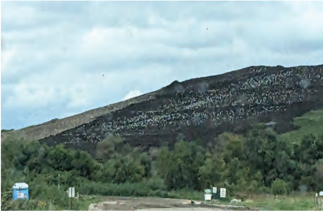
Top soil beimg spread over capping project