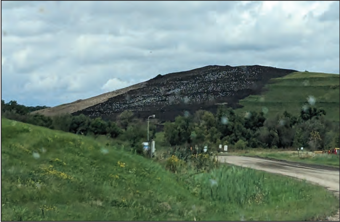
New cap project against previous cap project on West slope of Phases 2 & 3